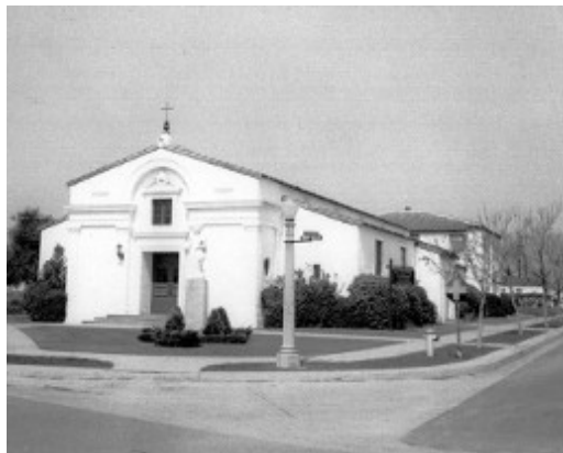
St. Peter Church

By 1988, our community had held the honor of receiving three patriarchal visits. His Beatitude Patriarch Paul Meouchi returned home to visit the parish of his youth in September of 1962, and he drew one of the largest gatherings of our community. His Beatitude Antonios Khoreiche visited our church in 1981. Also, His Beatitude Nasrallah Sfeir blessed our community by his visit in July of 1988. All three visits brought people together from near and far to welcome our shepherds.